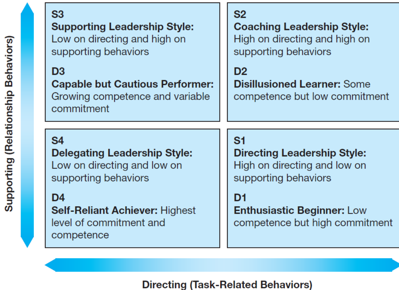
Figure 5-4 Situational Leadership II (SLII)