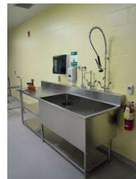
Tap and sink