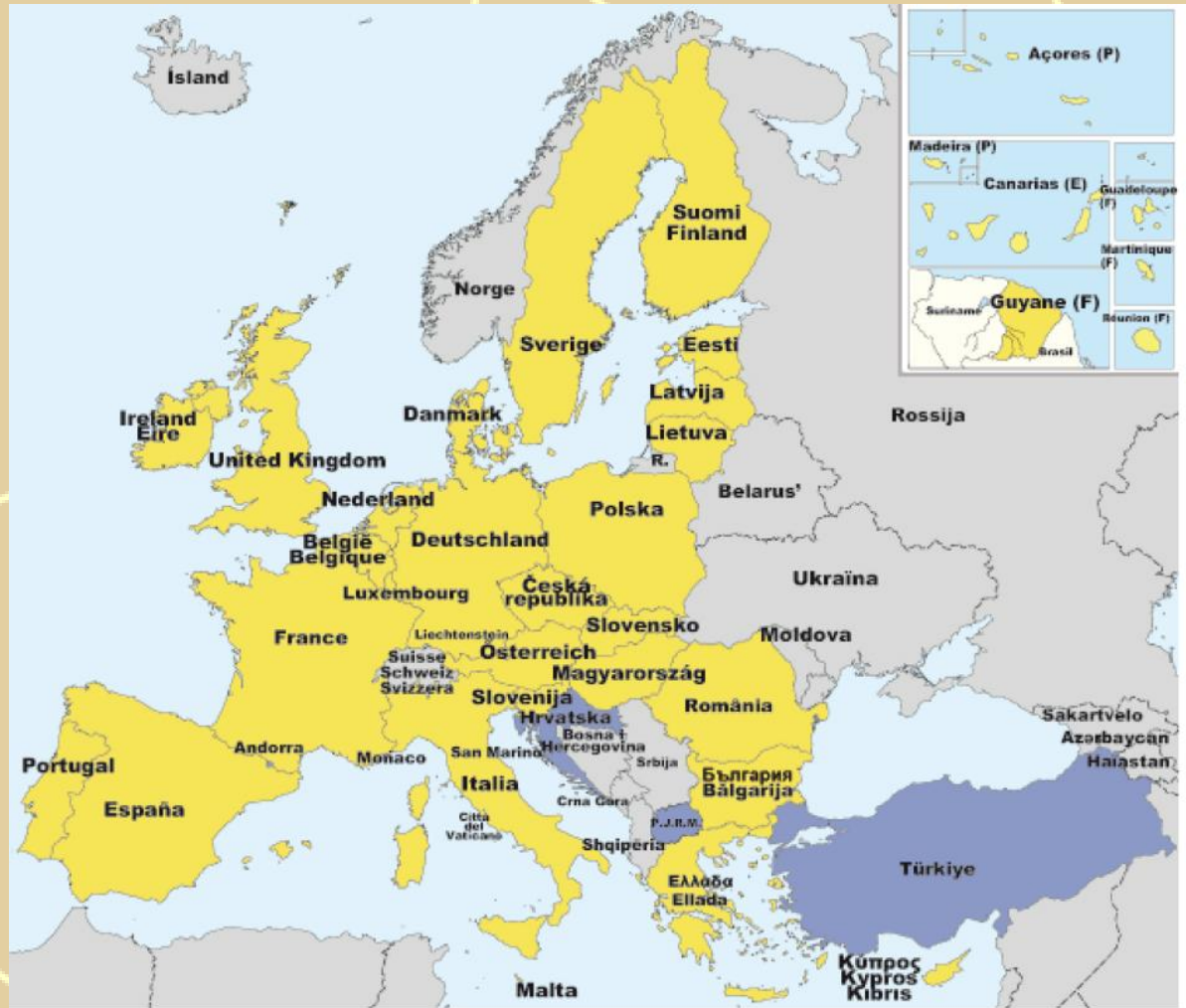
Map 8.1: Member States of the European Union in 2007